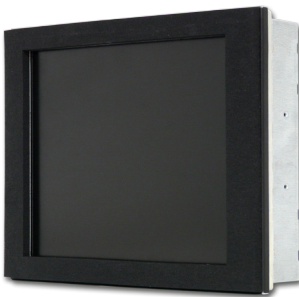
2364138 / 85-240V AC

The TFT-Industrial-Monitor is a modern concept to replace old or defective 12.1" TFT / 14" CRTs mounted in industrial controls.