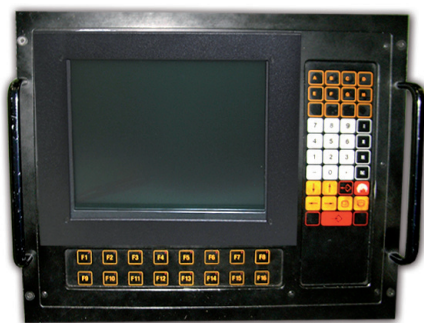
operator panel WF