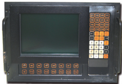
operator panel CP